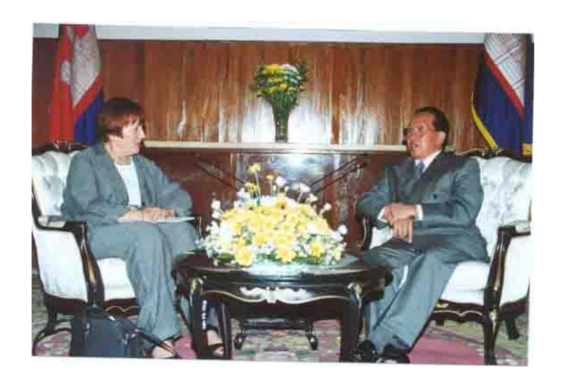
Senior Minister receives German Parliamentary Delegation

Senior Minister HOR Namhong briefed the delegation on the developments since the 1998 general elections, the prevalence of political stability and total peace following the establishment of the current coalition government and the collapse of the Khmer Rouge organization, the endeavor of the Royal Government to alleviate poverty by means of rural development, the reform process undertaken by the Government, and the economic growth achieved during the last year.