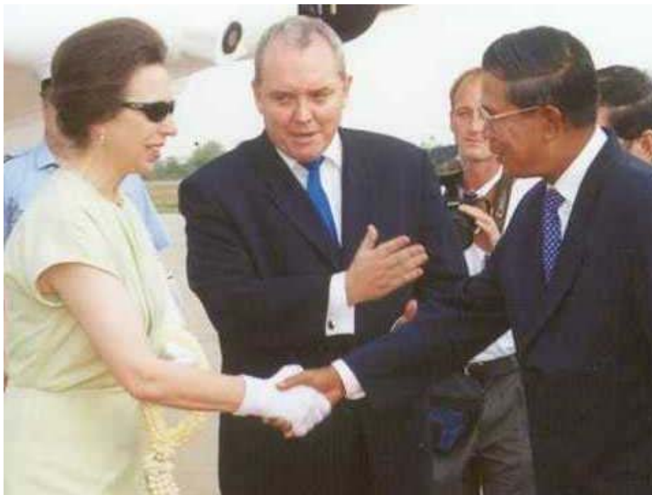
Samdech Prime Minister HUN Sen greets The Princess Royal Anne of Britain upon her arrival at Pochentong Airport

The Princess Royal had meetings with Samdech Krom Preah NORODOM Ranariddh, President of the National Assembly, and Samdech HUN Sen, Prime Minister.